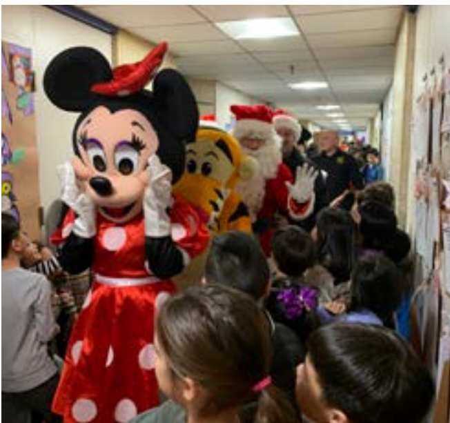
Fort Lee PBA spread some holiday cheer at School No. 2..